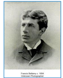
Francis Bellamy c. 1884

The U.S. government and its citizenry are primarily divided between the Republicans and Democrats, representing the views of Conservatism and Liberalism, respectively. These two parties are divided against each other. Each party tends to hold extreme positions on issues defining their affiliations. What could be the case for an American Party, which represents the people of the U.S., and upholds the law of the land, the U.S. Constitution? Isn't the country “one nation under God, indivisible, with liberty and justice for all?” The Pledge of Allegiance was written by Francis Bellamy, a Baptist minister, after the Civil War, and was revised in 1954 by Congress to include “under God.” 2 The U.S. is not a theocracy, but the powers (authorities) that be are ordained of God (Romans 13:1). God has established these authorities for the good of the people as a common grace.